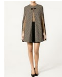
Zara Plaid Cape, $129.